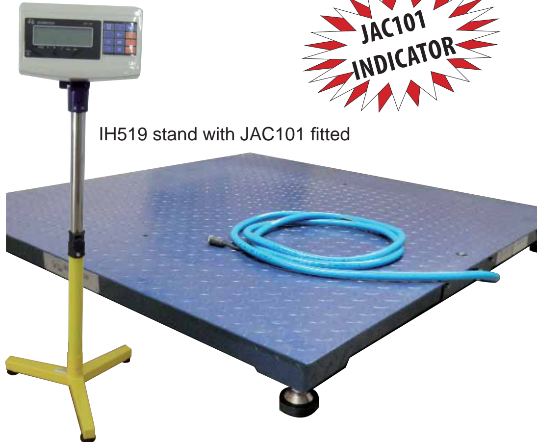
IH519 stand with JAC101 fitted