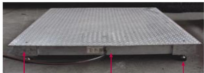
Protection end plate