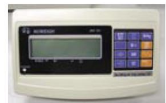
JAC 101 Electronic Indicator with a large easy to read display