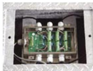
Stainless steel junction box located inside base. Entry is from top of scale.